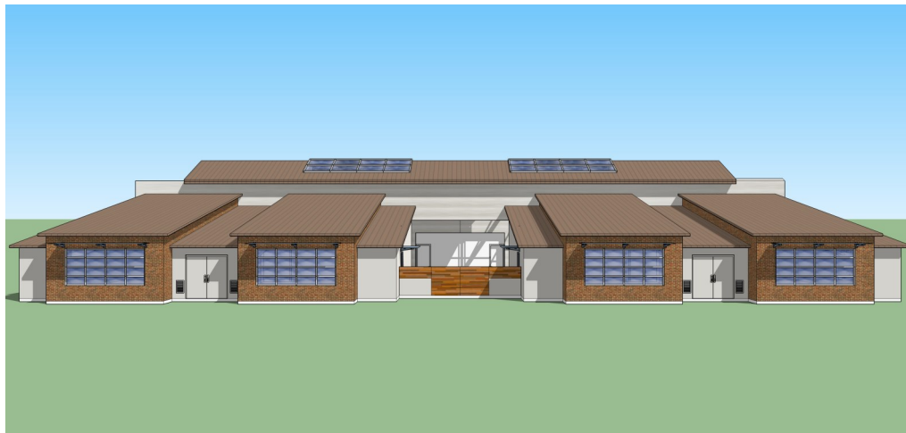
Architects Rendering of the New Classroom Building